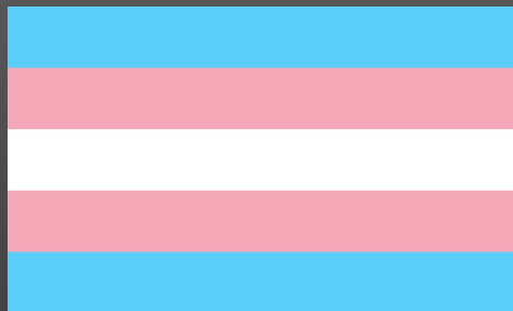
The Transgender Flag

Created in 1978, this flag is the symbol for everyone in the LGBTQ community. Gay refers to anyone who is attracted to the same sex.