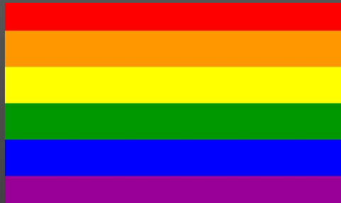
The Rainbow Flag